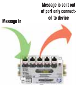
See the Communications section for details on the E-SW05U Ethernet Switch

The H2-ECOM100 supports the Industry Standard Modbus TCP Client/Server Protocol